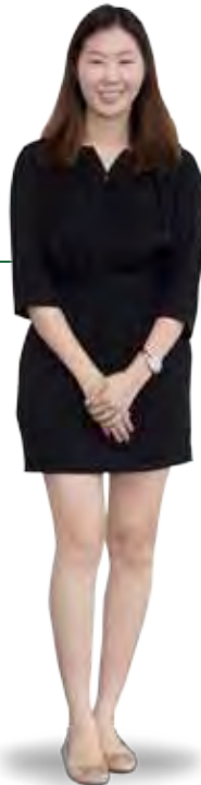
LEE WEN LING ENVIRONMENT